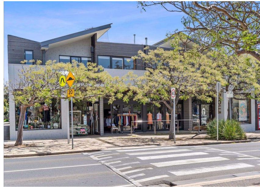
Commercial building example (double storey)